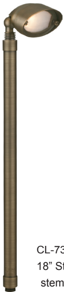
CL-733B-AB 18" Standard stem shown

Warranty: Limited lifetime warranty on fixture housing and stem against manufacturer's defects.